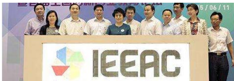
Figure 1 College students' innovation and entrepreneurship

For national development, innovation and entrepreneurship are the driving force of social progress and economic development, and for education, innovation is the development concept of teaching and educating people. China's higher education has been advocating innovation for a long time, and has experienced many years of reform and development, many colleges and universities have carried out in-depth curriculum reform, constantly update the education model. With the rapid development of Internet technology, colleges and universities use the advantage of "Internet+" to create new models of innovation and development, and establish creative parks with units outside the school to increase students' practical experience and provide opportunities for students to develop [2].