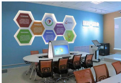
Figure 2 Innovation and entrepreneurship education for college students

With the continuous development of the society, innovation and talent have become the key words of the new era, the state pays more and more attention to higher education in the education level, and the education level of our country is higher and higher. However, the habit of examination-oriented education has continued for many years, which leads to many colleges and teachers pay less attention to the education of innovation and entrepreneurship. The purpose of the innovative entrepreneurship education and innovation education mechanism is to cultivate college students' innovative entrepreneurship consciousness, strengthen their comprehensive ability, make them become the talents needed in the new era, keep the initial mind after employment, have a correct outlook on career selection and life, make greater contribution to the development of the country, and realize higher self-worth and social value at the same time. However, in the process of carrying out the innovation and entrepreneurship education in colleges and universities, many teachers and school leaders think that the cultivation of innovation consciousness is the government's business, and the training of entrepreneurial ability is the responsibility of the enterprise.